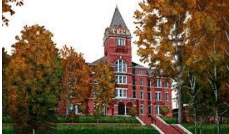
Georgia Institute of Technology, Atlanta, Ga